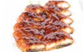
Eel Kabayaki $15.00