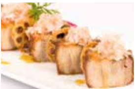
Caramel Miso Pork Belly $15.00