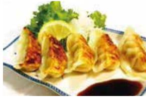
Gyoza(Steamed/ Pan-fried) $12.80