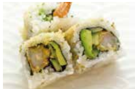
Prawn Tempura Roll 8pcs -$16.50