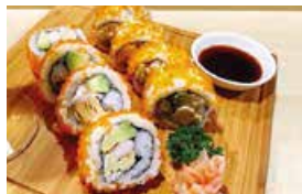
Flying California Roll 8pcs -$21.00