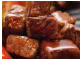
Teppanyaki Beef $28.50