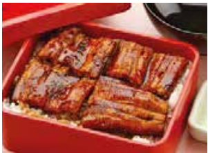
Unadon Set $28.50