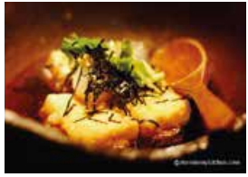
Agedashi Tofu $7.80