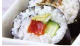
Tuna Roll (Raw) 5pcs -$9.50 10pcs -$17.50