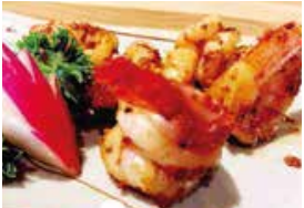
Garlic Prawn $16.80