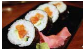
Salmon Roll 5pcs -$9.50 10pcs -$17.50