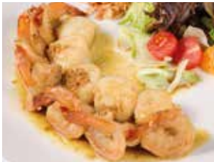
Teppanyaki Scallop & Prawn $31.80