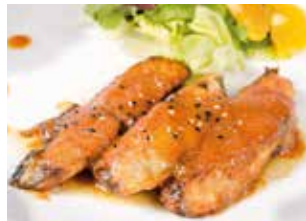
Miso Fish $26.50