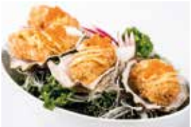
Crumbed Oyster $15.00