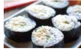
Tuna Roll (Cooked) 5pcs -$8.50 10pcs -$15.50