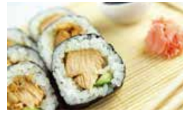
Chicken Roll 5pcs -$8.50 10pcs -$15.50