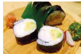
California Roll 5pcs -$9.50 10pcs -$17.50