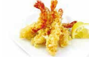
Tempura Prawn $16.80